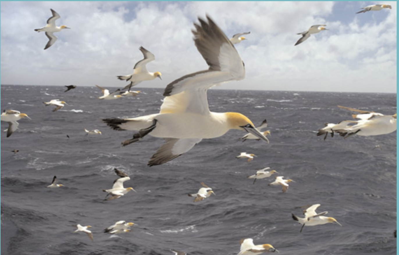
Cape gannets escort the hake trawler Harvest Lindiwe as it heads back to its home port of Saldanha, near Cape Town, South Africa.

Unilever believes that one of the best and most sustainable ways it can help to address global social and environmental concerns is through the very business of doing business in a socially aware and responsible manner.