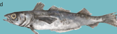
South African hake Merluccius capensis

For Primo , Harvest Lindiwe's guardian of quality – just as for the entire crew of 75 – sustainable fishing means so much more than the prized MSC label on their product. For them, their families and their communities, sustainability is their future.