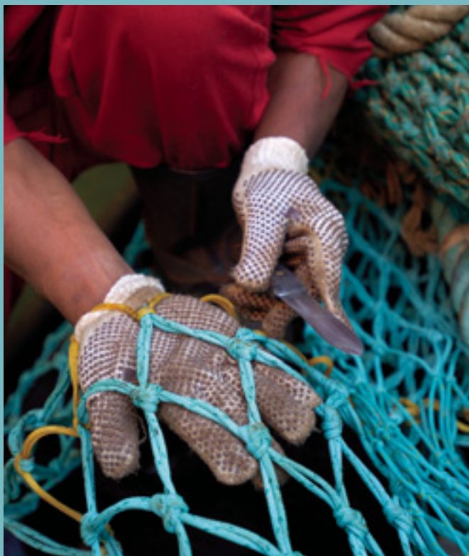
A large mesh size allows small fish to escape the trawl.

"Certification completes the link from fishermen to consumers, allowing us to include on-pack information – in the form of a well-